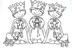
We Three Kings

Please join us at 9am as we celebrate the birth of the baby Jesus as seen through the eyes of the Three Kings. This musical program is certain to have you singing along and what a great way to celebrate the importance of Christmas!